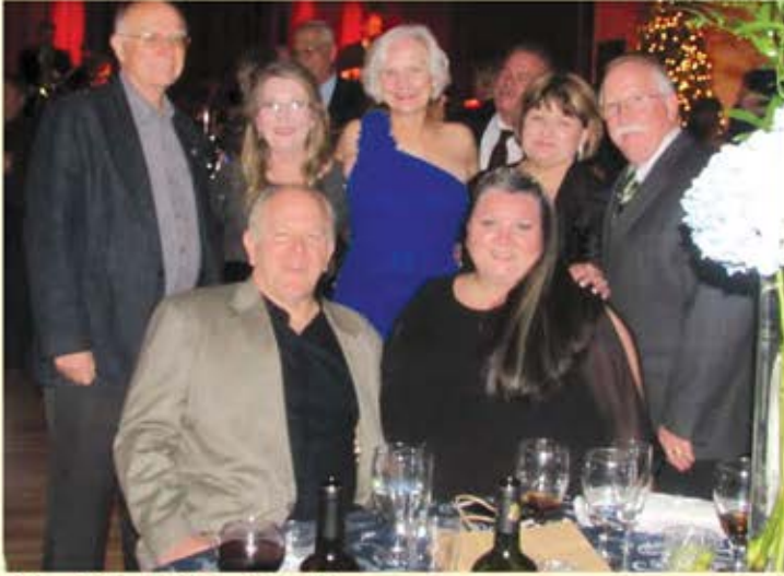
New Year's Eve Revelers