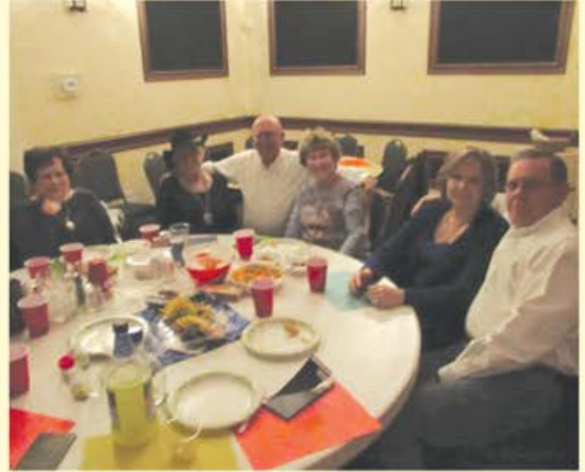
Country Western Dance, but not dancing