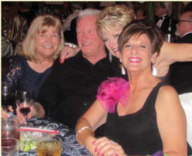
Some Guys have all the Luck!