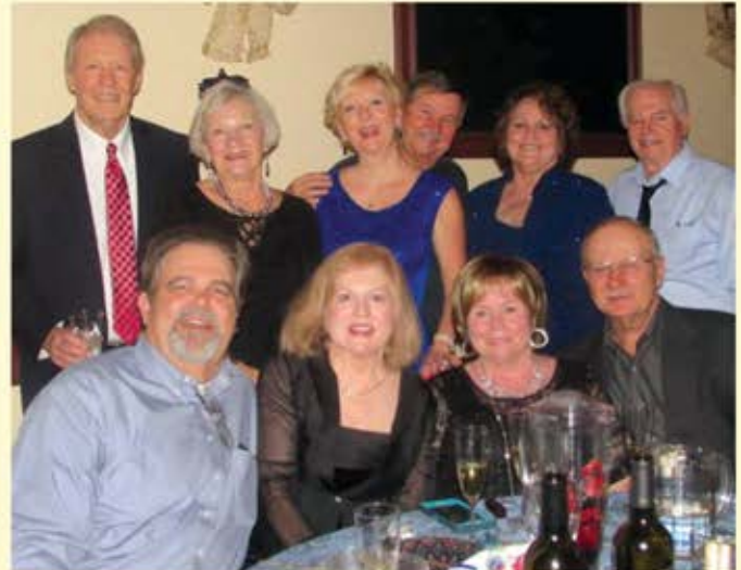
More New Year's Eve Revelers