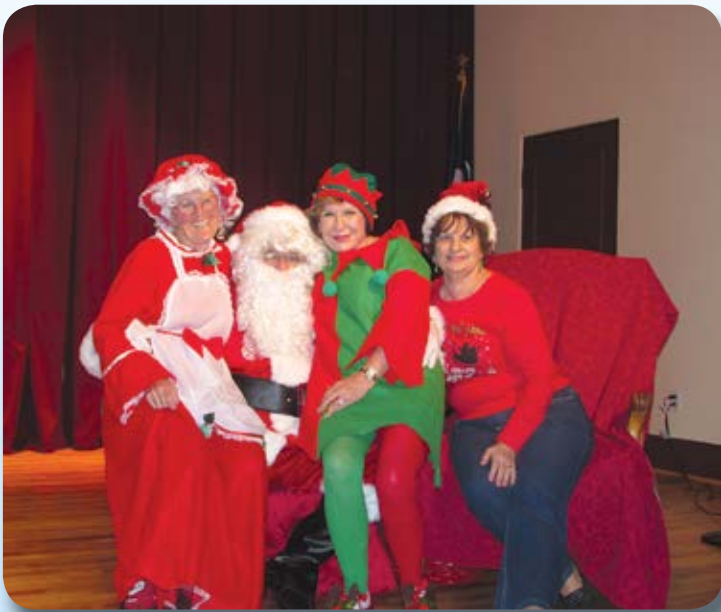
Ladies with Santa