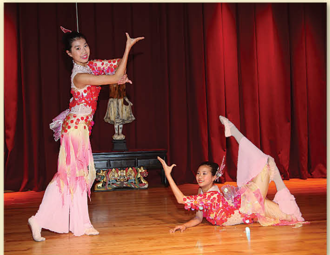
DANCE OF ASIAN AMERICA