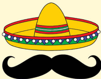
Cinco De Mayo Celebration