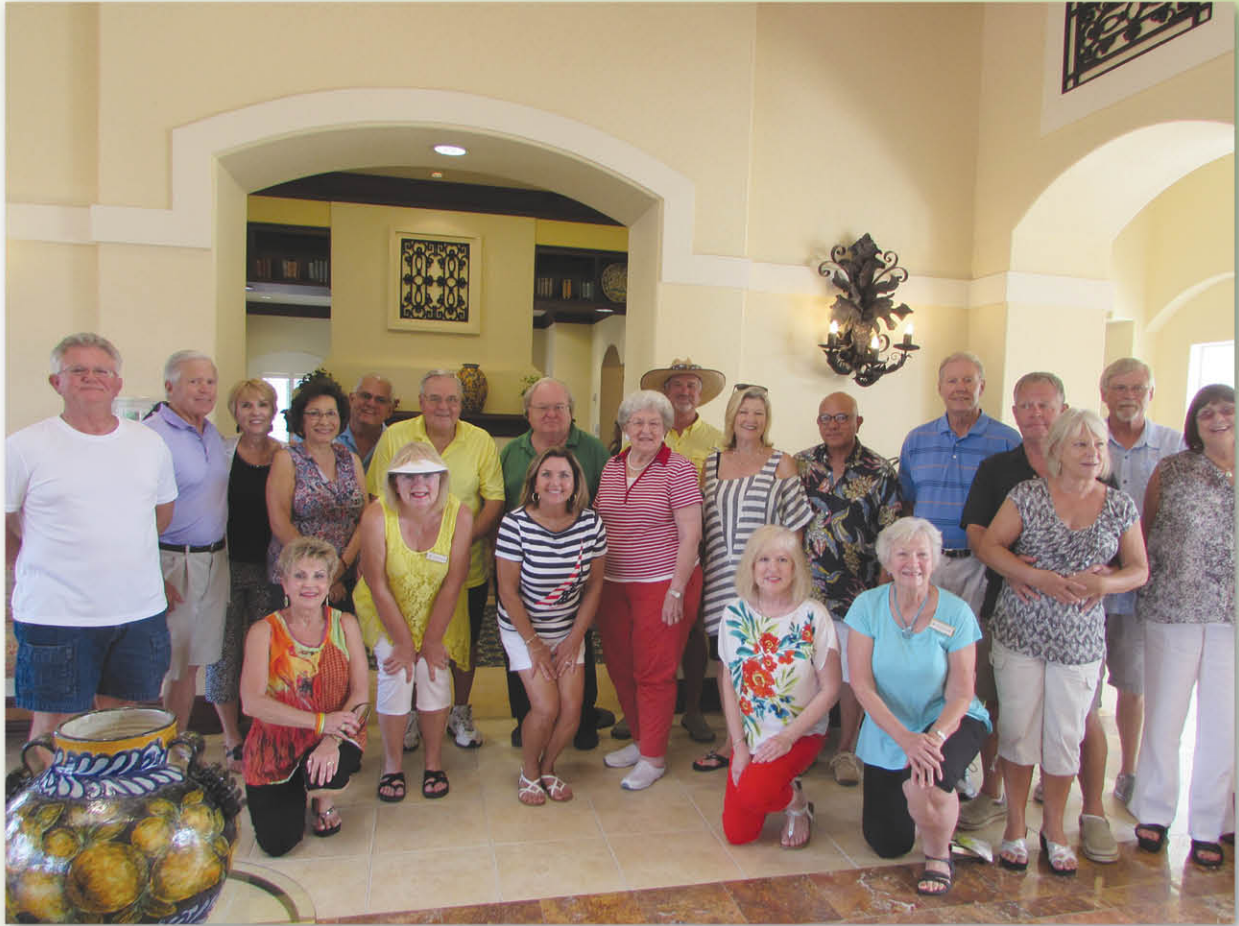
Gardeners After the Tour