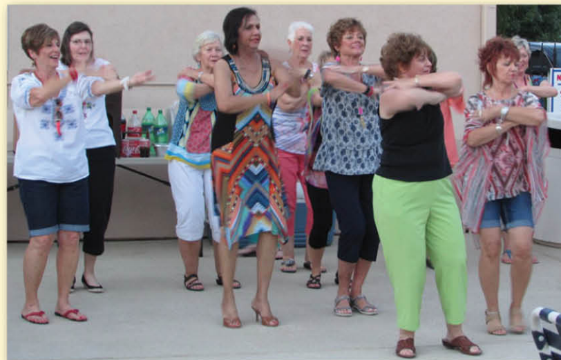
All Lined Up for Cinco de Mayo