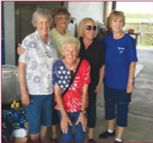
Belles Donating to the Pearland Animal Shelter