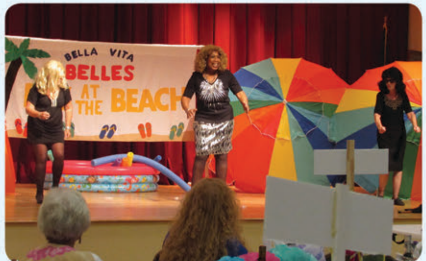
Tina Turner and the Girls