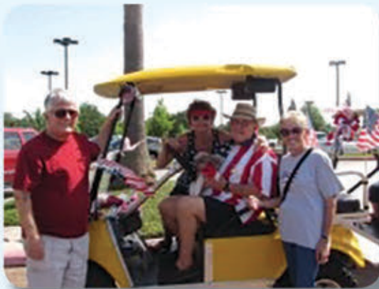
4th of July