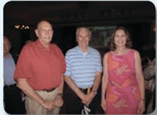
Happy Birthday BellaVita