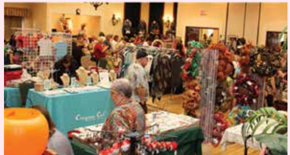
Mistletoe Market Vendors