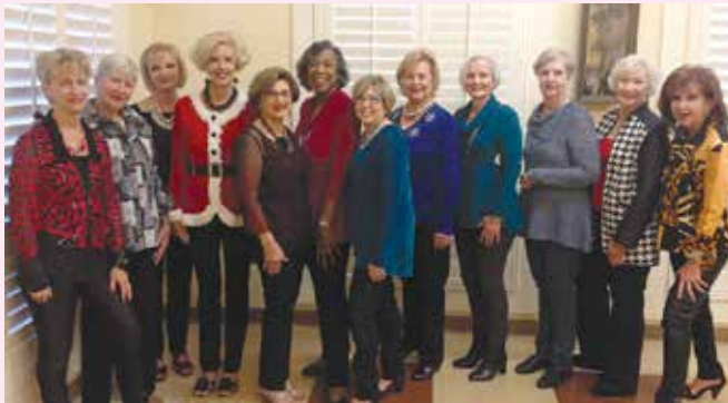
Fashion Show Models