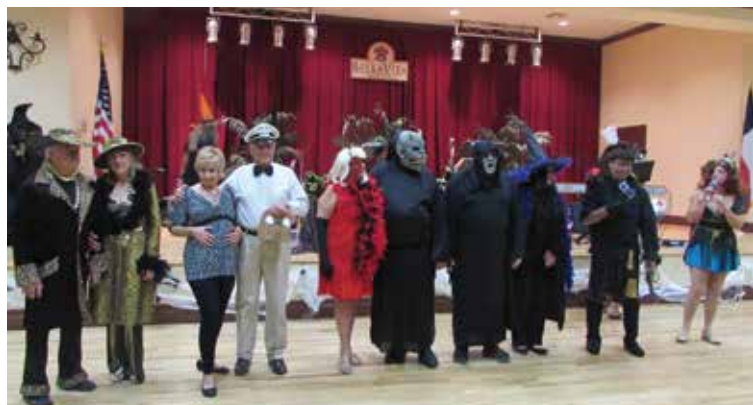
"The Ugly, the Good? and the Bad?"