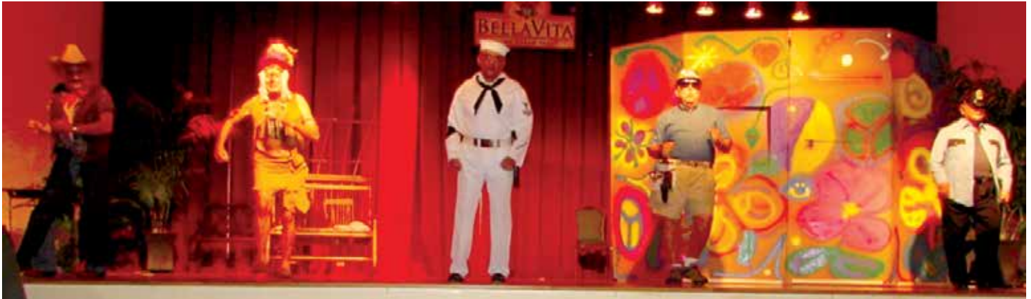
"The men show variety at the YMCA."