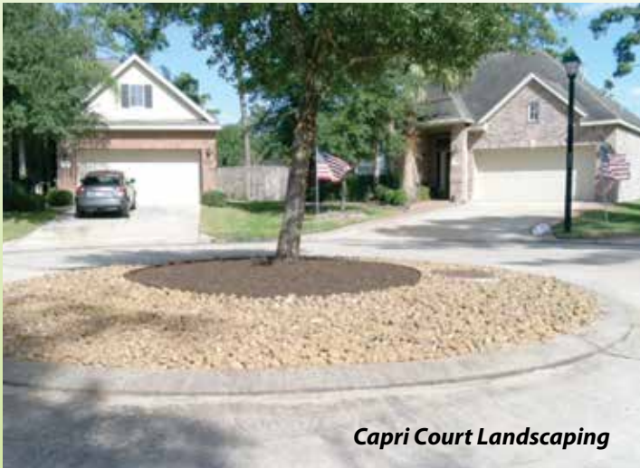
Capri Court Landscaping