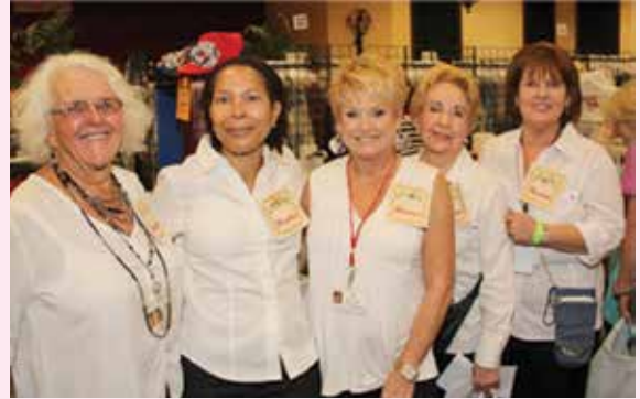
Mistletoe Market Hostesses