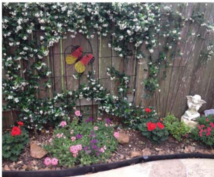
Ruth Cheek's garden on the garden tour

We also have fun. The clubs have planned a variety of events this spring. Let's get out and enjoy our surroundings. We are fortunate to be able to live in a community like BellaVita – the people make it what it is.