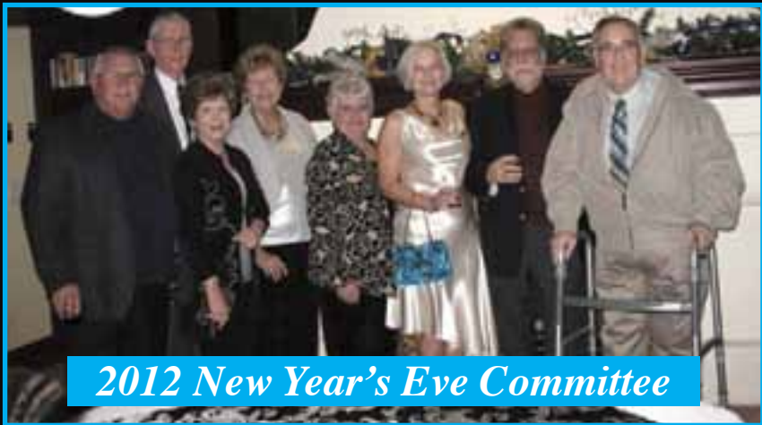
2012 New Year's Eve Committee