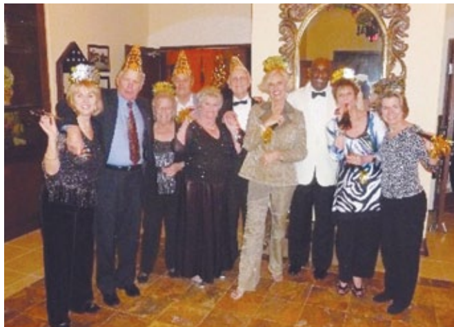
Pictured here are some of our residents celebrating New Year's Eve.