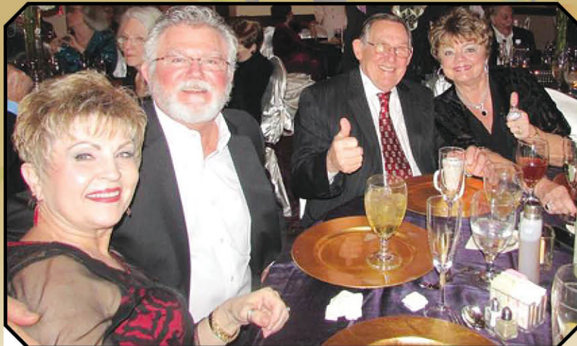
Dudley's and Goza's