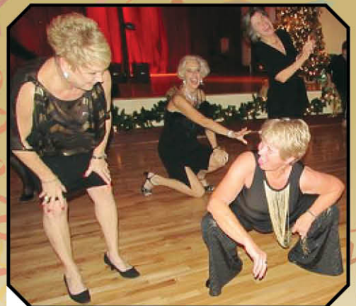
"Getting Down" 2014