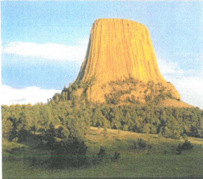
Devil's Tower National Monument, Wyoming