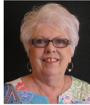
Volunteer of the Quarter